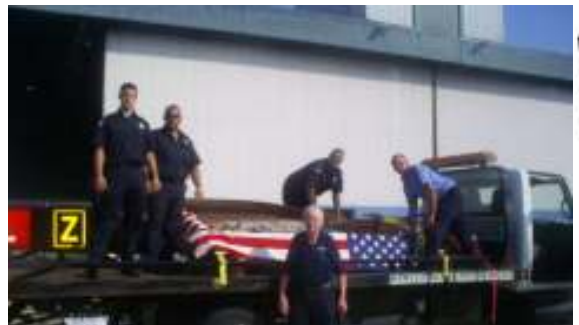
Wayside Firefighters loading World Trade Center Steel in NYC to be used on the memorial.

The Fire Company is seeking your help, the residents of Tinton Falls, to help fund the construction of this unique 9/11 Firefighters Memorial which will be permanently located on Asbury Avenue and open to the public.