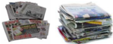
NEWSPAPERS & INSERTS Do not tie