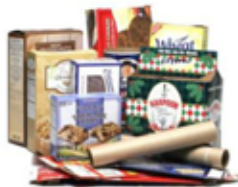
CHIPBOARD Flatten, do not tie