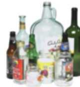
GLASS BOTTLES & JARS Remove Caps