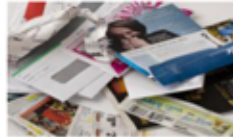
MAIL & SCHOOL OR OFFICE PAPER Do not tie or place in