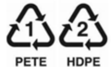
PLASTIC POURABLE BOTTLES Remove Caps